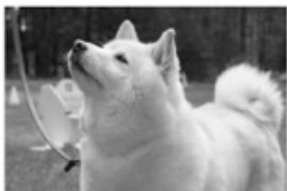
in memory of Sheba