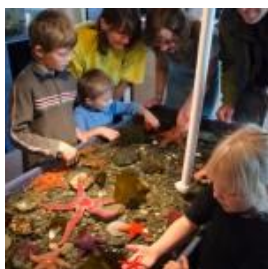
Discovery Passage aquarium