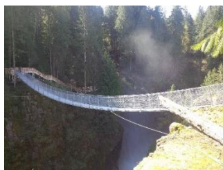
Elk Falls Provincial Park Suspension Bridge