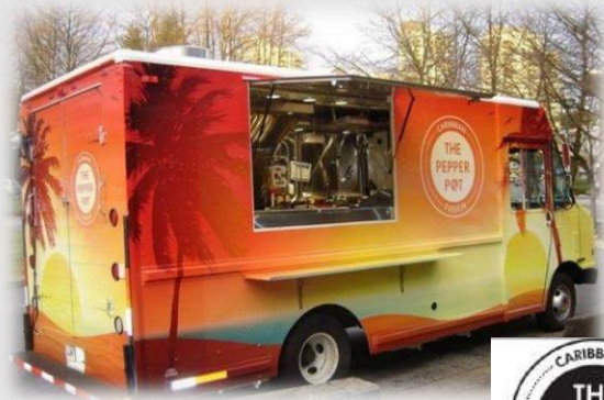
Saturday and Sunday