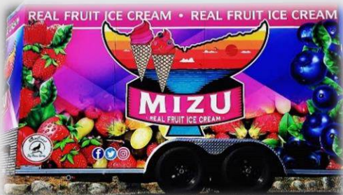
Saturday and Sunday