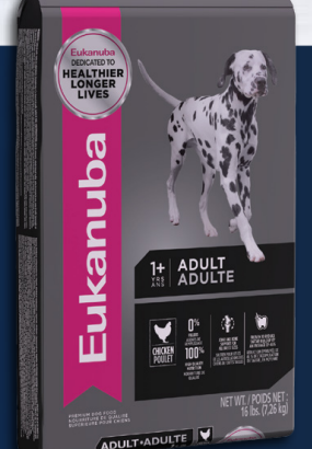
Exclusively at pet specialty stores

PROVEN ADULT NUTRITION FOR SHORT AND LONG-TERM HEALTH BENEFITS