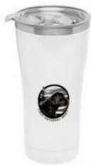
22 oz. STAINLESS STEEL TRAVEL MUG - $20