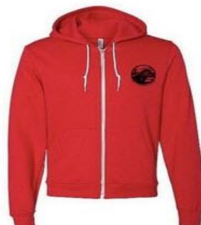
RED UNISEX COTTON HOODIE - $80 SIZES: XS - XL