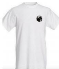
COTTON T-SHIRT MENS SIZES S-3XL - $33 LADIES SIZES S-2XL - $33