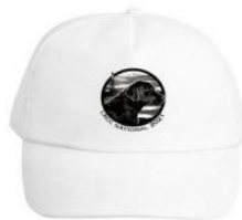
COTTON BASEBALL CAP - $20