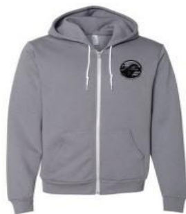
SLATE GREY UNISEX COTTON HOODIE - $80 SIZES: XS - 2XL