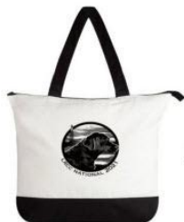
COTTON TOTE BAG with TOP ZIPPER & INTERIOR ZIPPER POUCH - $25