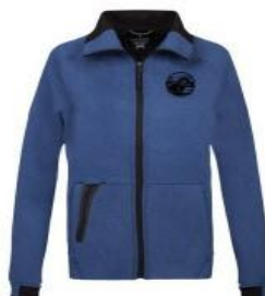
LADIES KNIT JACKET in BLUE HEATHER - $95 SIZES: XS - 2XL