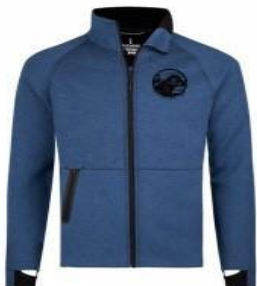
MENS KNIT JACKET in BLUE HEATHER - $95 SIZES: S - 3XL