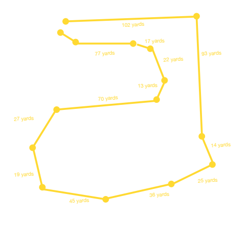
Sunday Course Plan - approx. 600 yards